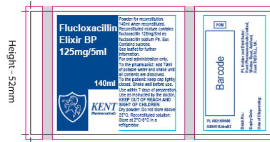
Base Label - 101mm