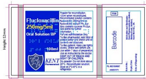
Base label - width 101mm